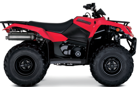
Flame Red (YT9)