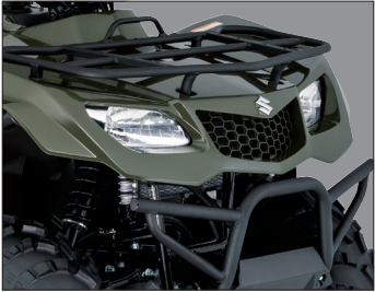
Dual 35W headlights with high and low settings