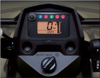
LCD digital instrumentation