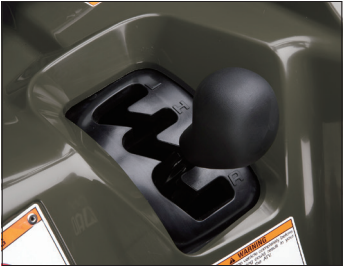
Gate-type shift lever