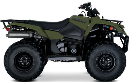
Terra Green (YLG)