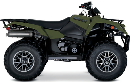
Terra Green (YLG)